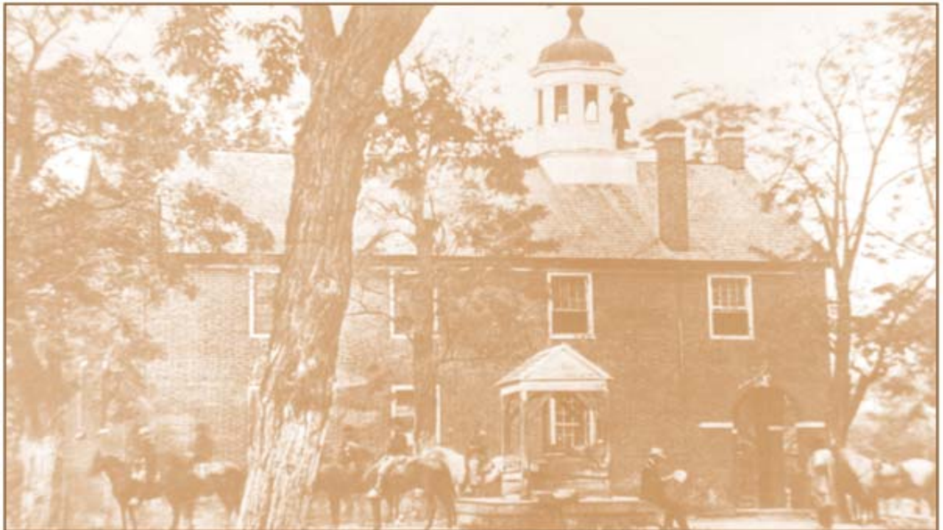
Fairfax County Courthouse.